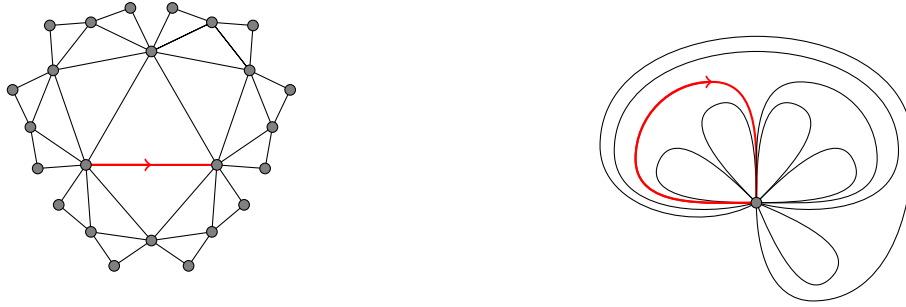
Figure 1: The beginning of the construction of \mathbb{T}_0 (on the left) and \mathbb{T}_* (on the right). Note that these are two different triangulations: \mathbb{T}_0 has infinitely many vertices whereas \mathbb{T}_* has only one.

We finally introduce two important examples of "degenerate" planar triangulations \mathbb{T}_0 and \mathbb{T}_* with infinite vertex degrees. We denote by \mathbb{T}_0 the triangulation obtained by gluing the edges of the triangles along the structure of a complete binary tree (as on the left of Figure 1). This is also the natural way to extend the PSHT \mathbb{T}_\lambda to the case \lambda = 0 . On the other hand \mathbb{T}_* (on the right of Figure 1) is the only infinite, planar triangulation with only one vertex: it is obtained by forming a triangle with three loops, and then recursively adding two loops inside of each loop to form new triangles. We highlight that our definition considers \mathbb{T}_0 and \mathbb{T}_* as two distinct objects, even if they have the same dual. Indeed, the vertices are not glued in the same way in \mathbb{T}_0 and in \mathbb{T}_* . We are now able to state our main theorem.